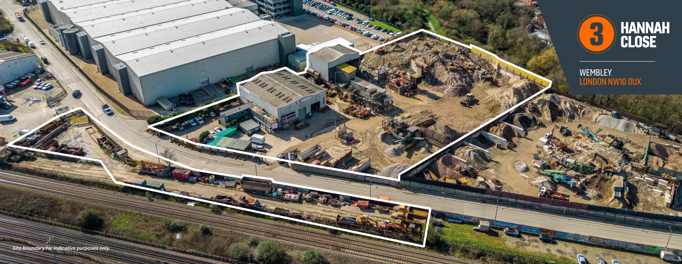
Site boundary for indicative purposes only.