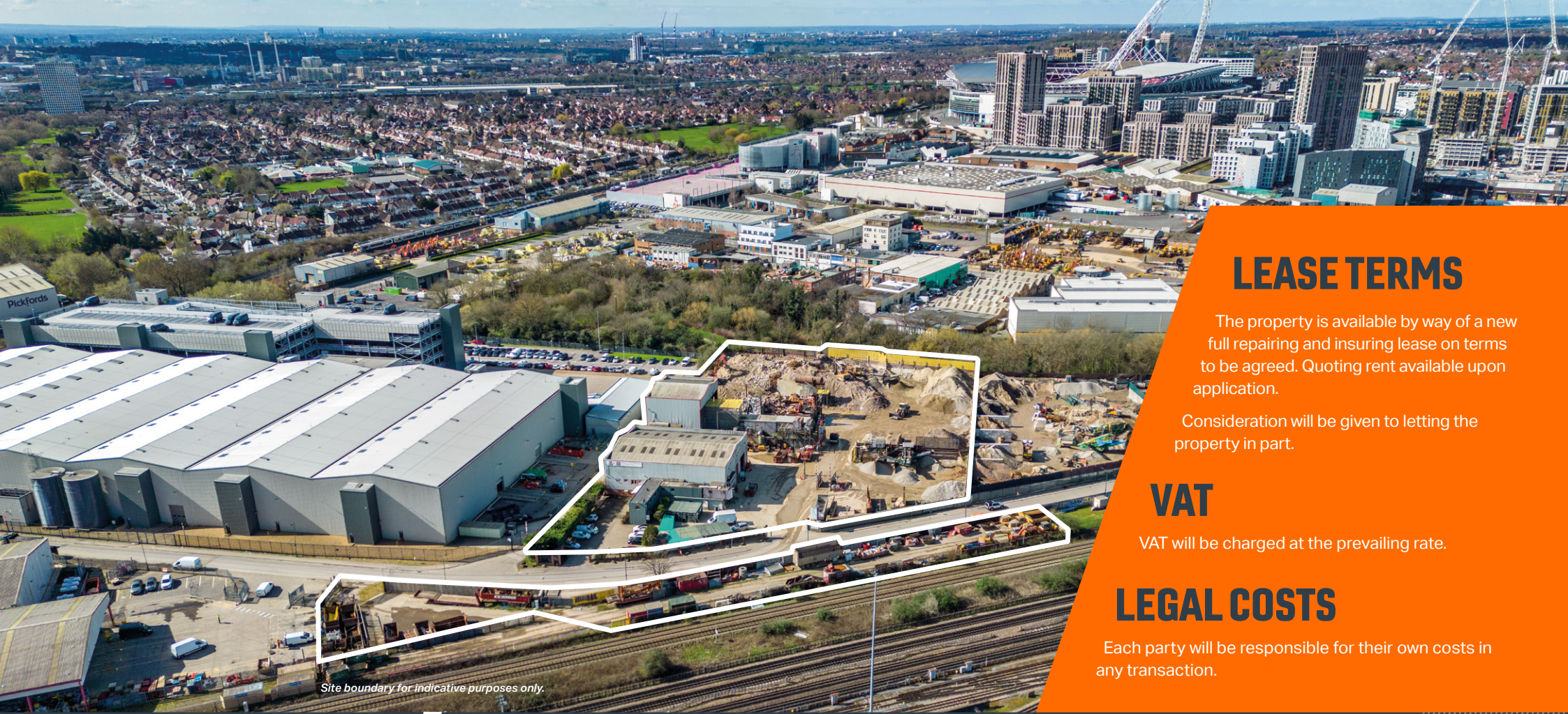
Site boundary for indicative purposes only.