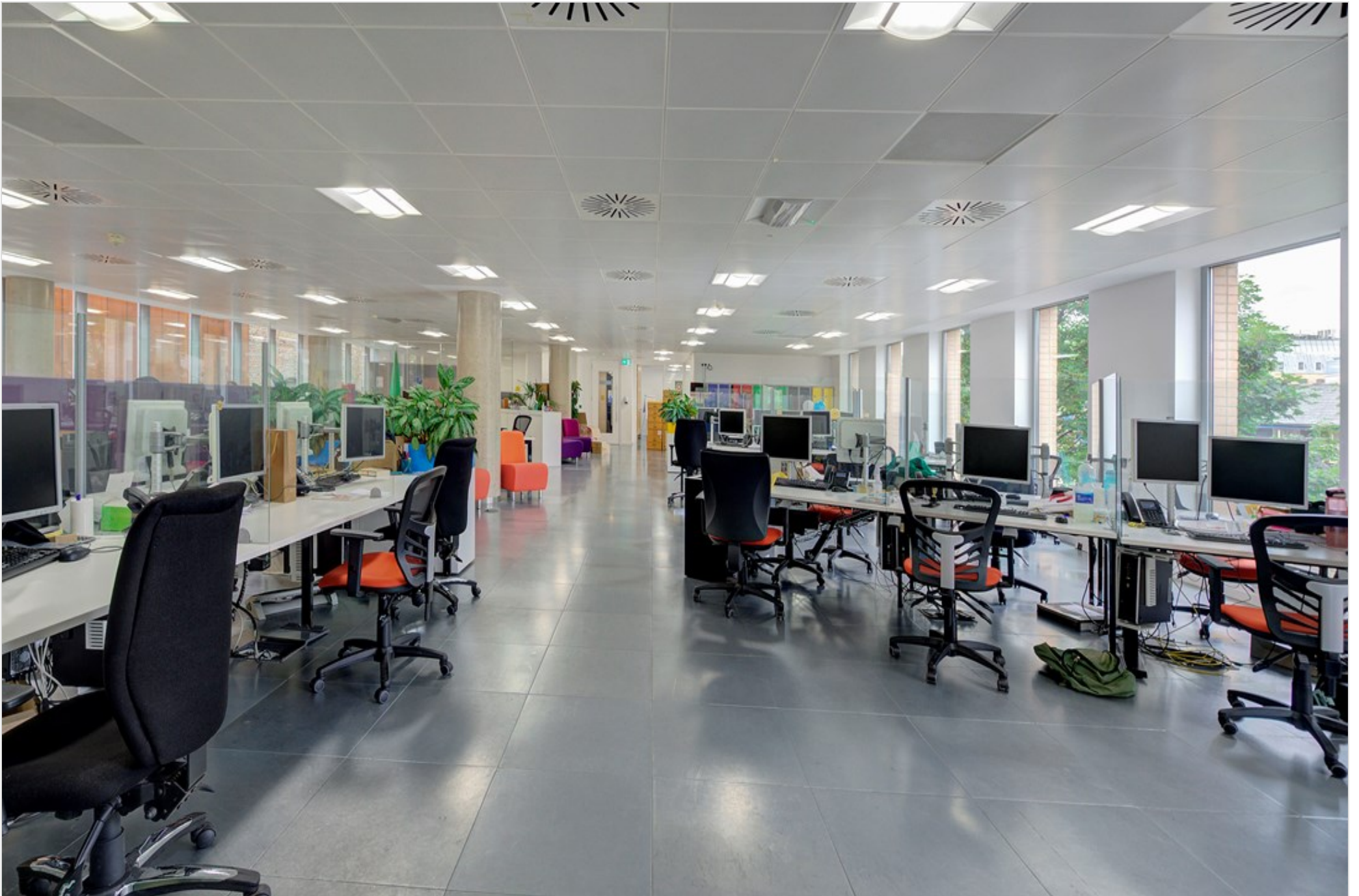
30 Park Street, London, SE1 9EQ