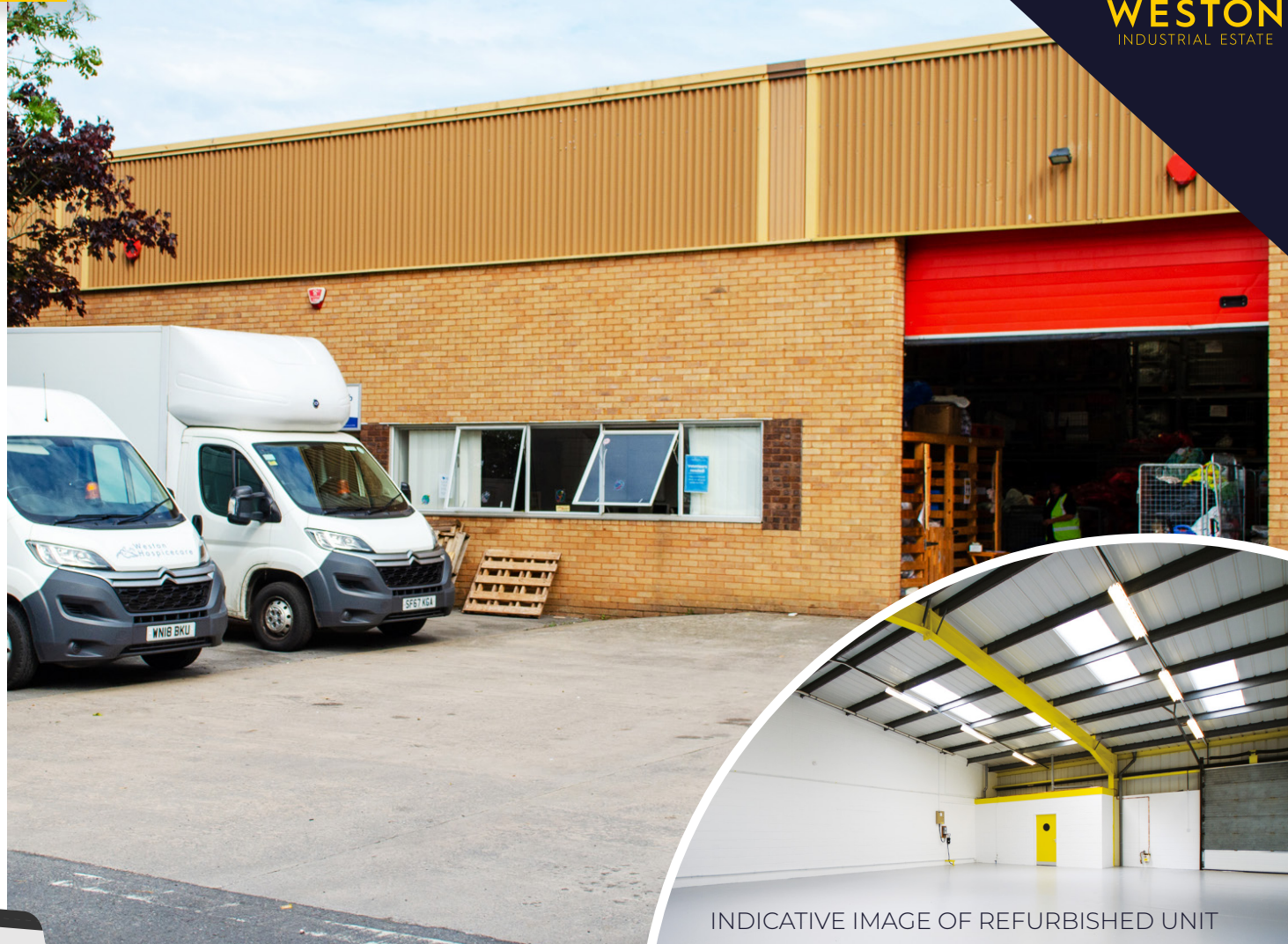
INDICATIVE IMAGE OF REFURBISHED UNIT