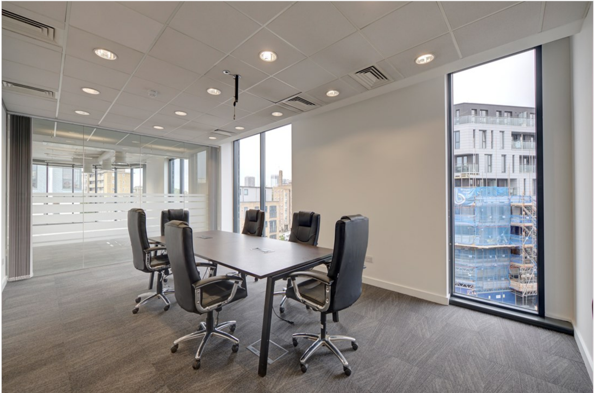
93 Great Suffolk Street, London, SE1 OBX