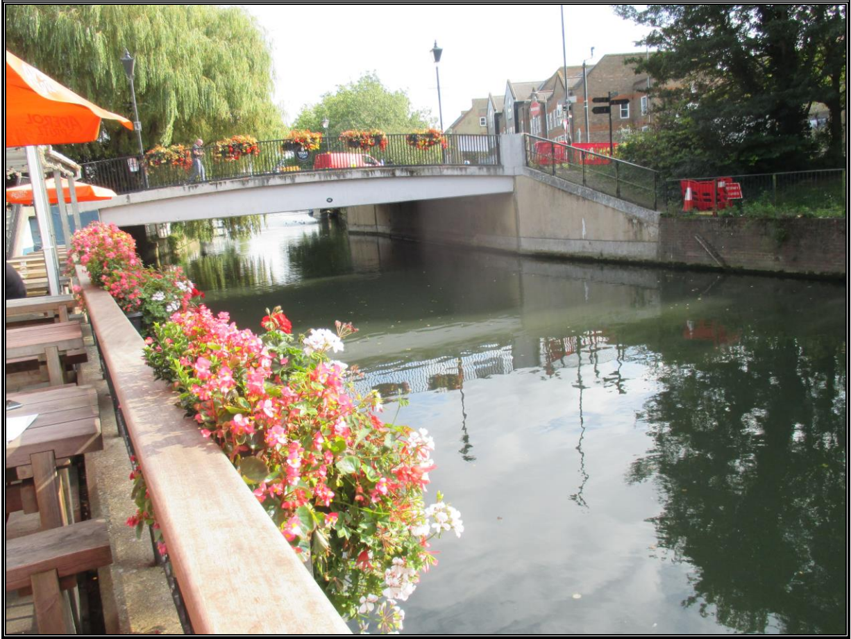
Picturesque River Lea behind the premises