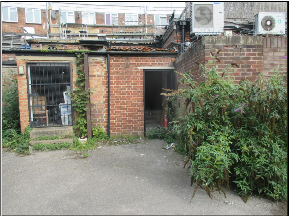
Rear vehicular access