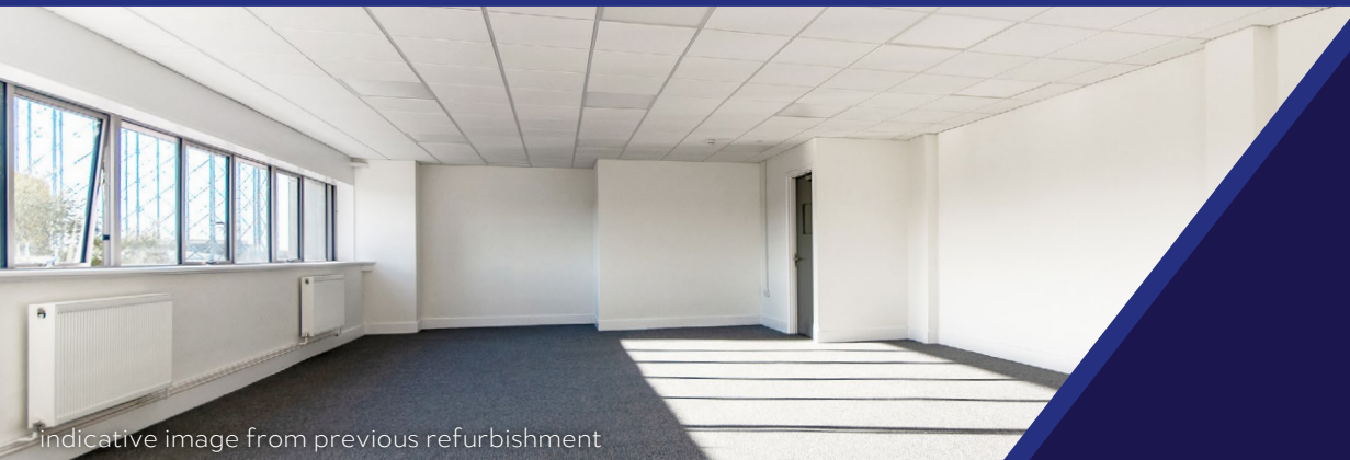
indicative image from previous refurbishment