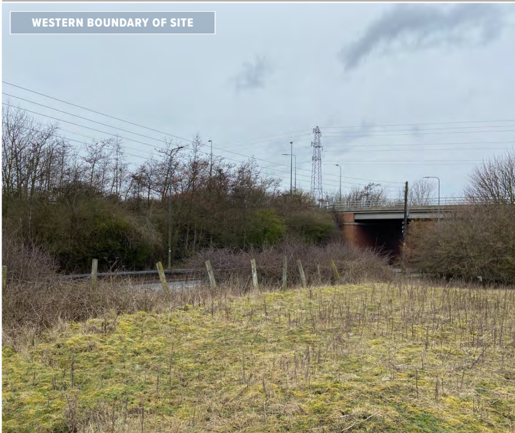
WESTERN BOUNDARY OF SITE