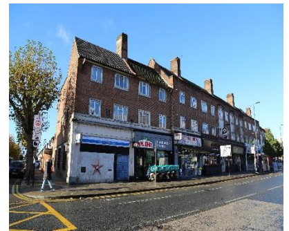
Planning Approved CGI Image