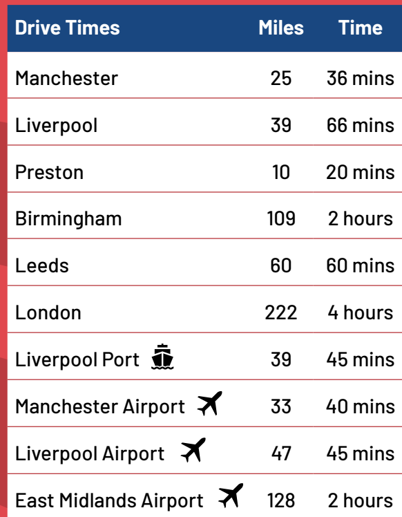
HGV Drive Time Reach

56.5% of the population can be reached within a 4.5 hour HGV drive time. With the M61 (jct. 8) on your doorstep and within close proximity of other major transport links, you'll be based at the core of the nations motorway network.