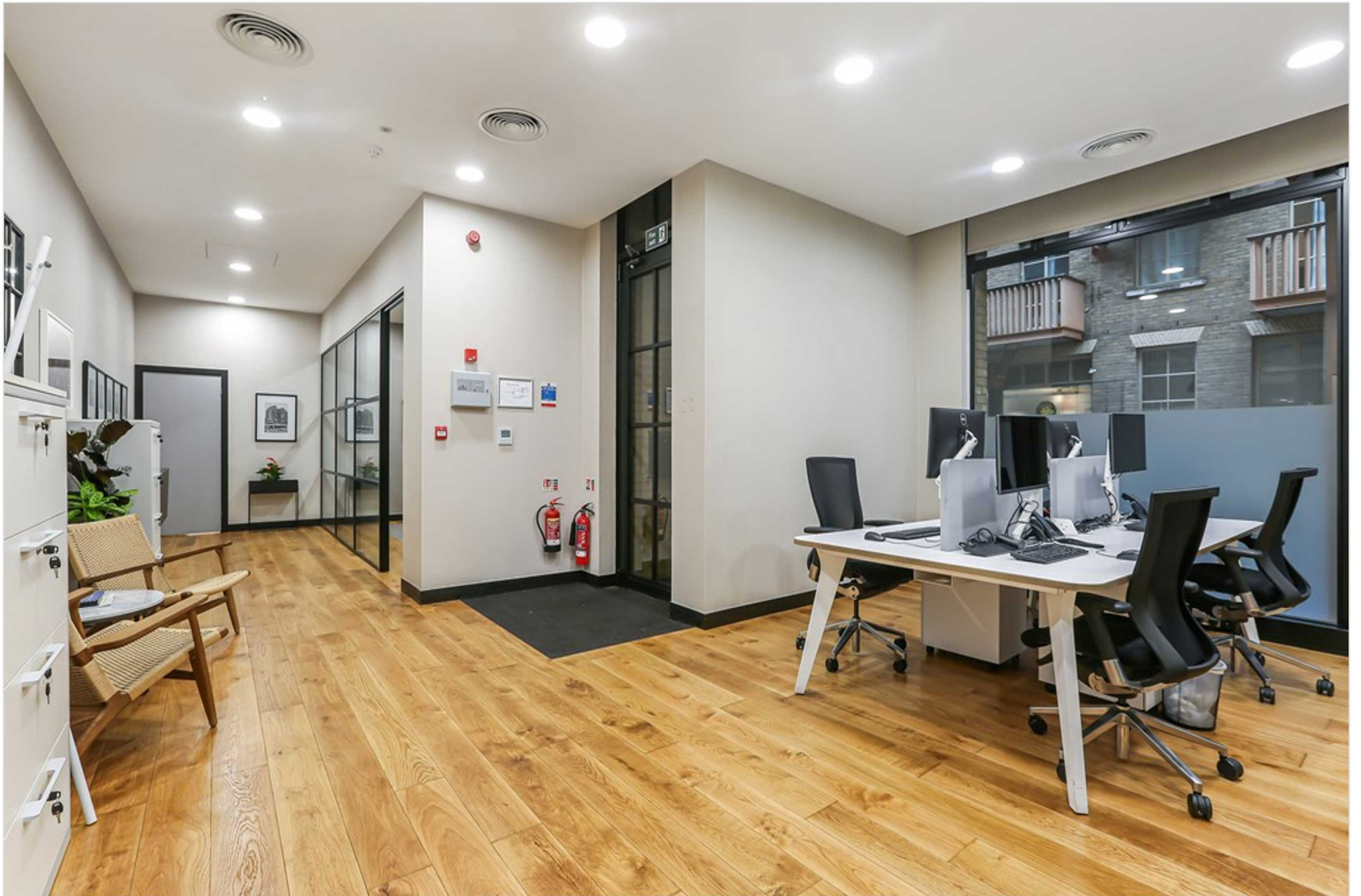
1 The Circle , Queen Elizabeth Street, London, SE1 2JE