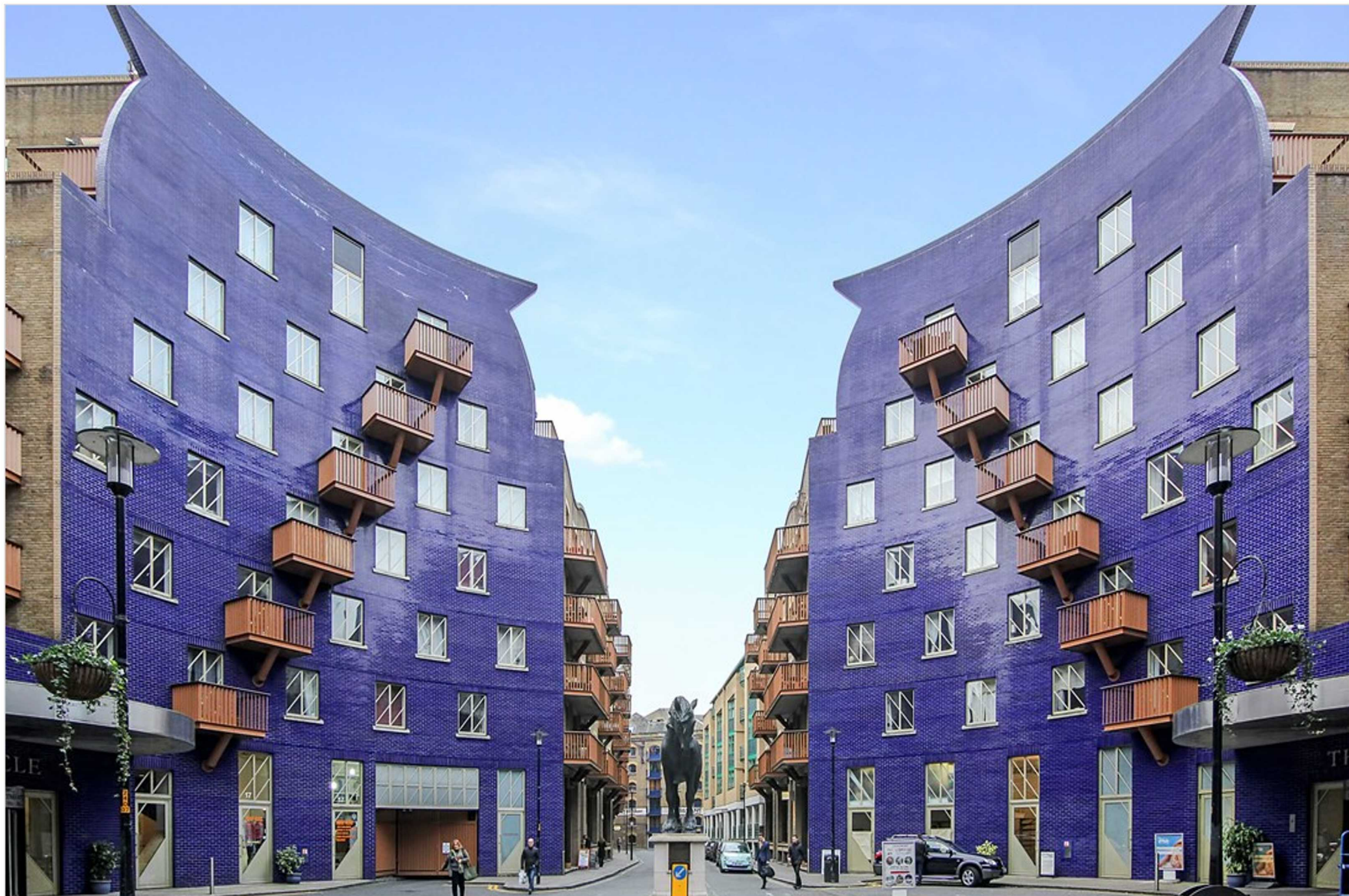
20A The Circle, Queen Elizabeth Street, London, SE1 2JE