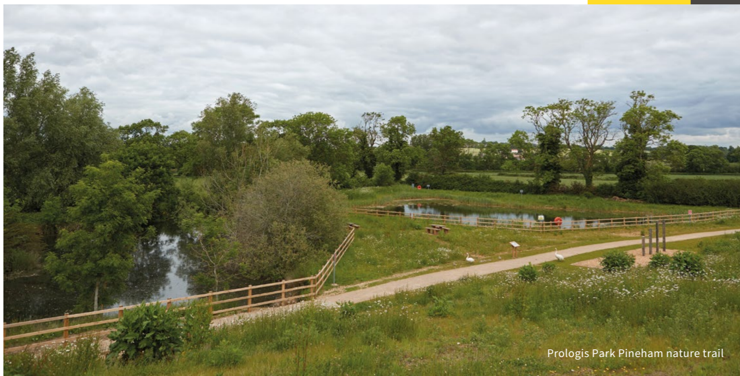
Prologis Park Pineham nature trail