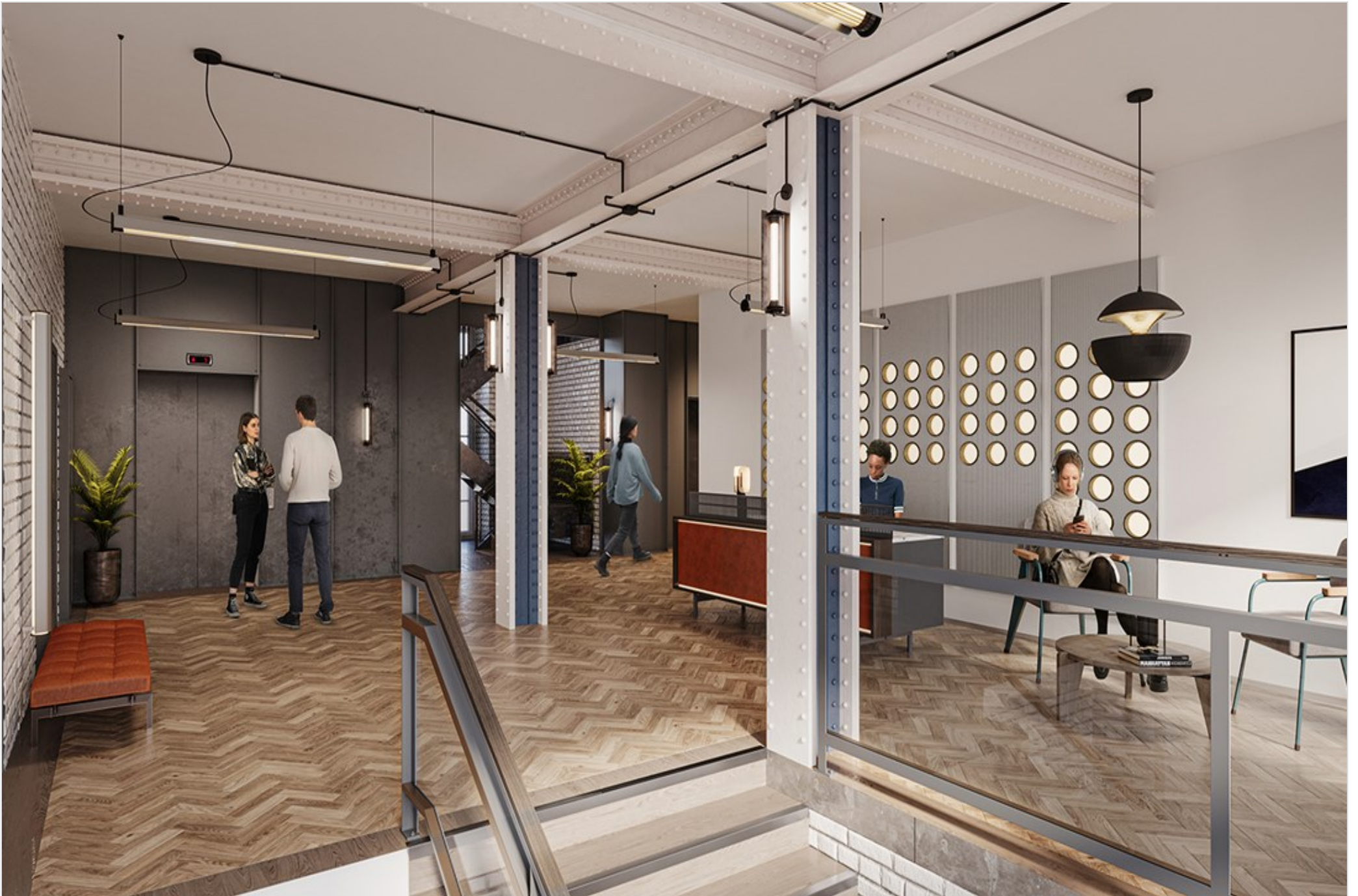
Union House, 182-194 Union Street, London, SE1 0LH