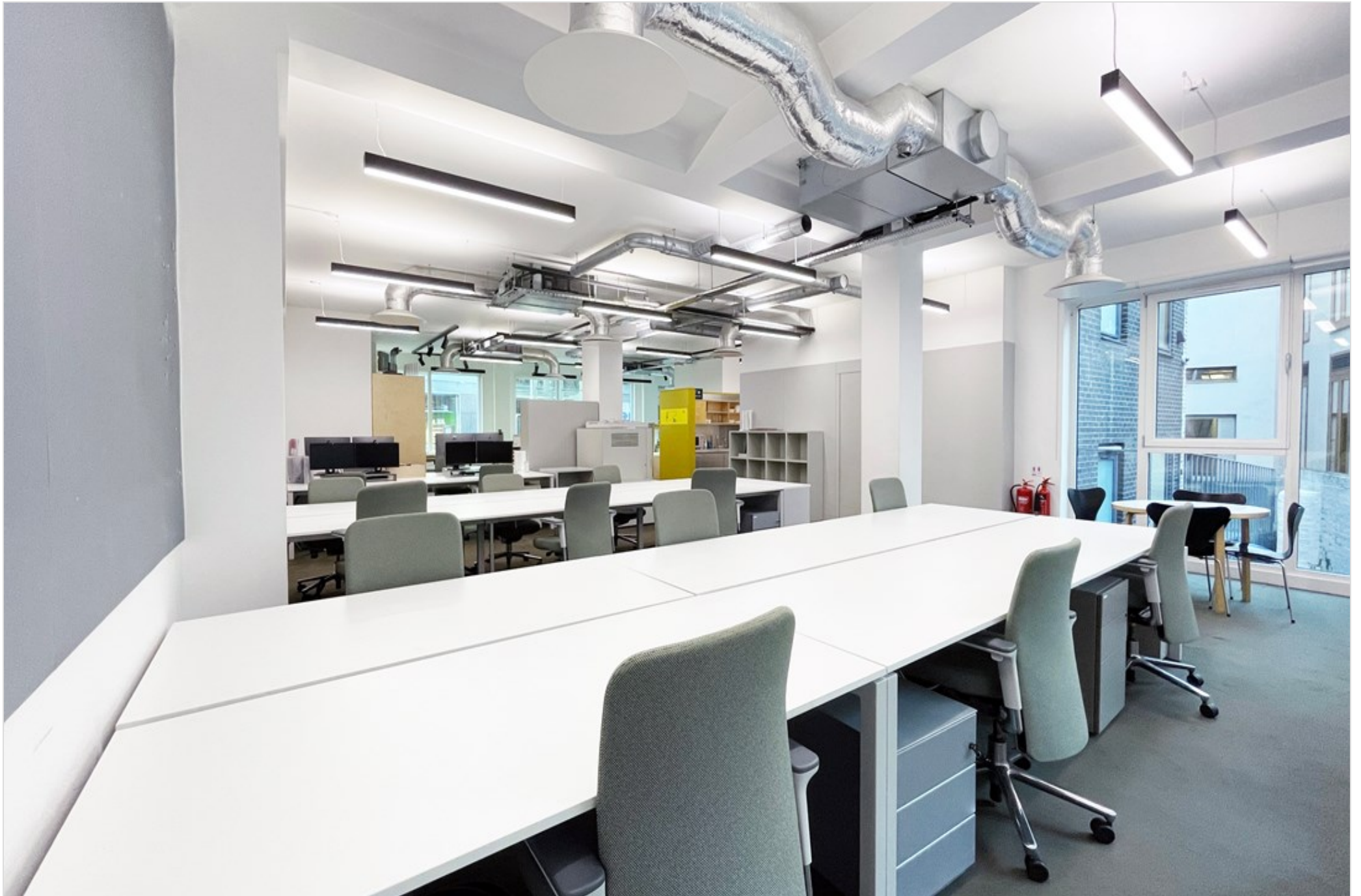
Southwark Studios, 93 Southwark Street, London, SE1 0JE