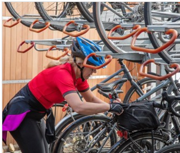
Southwark Studios, 93 Southwark Street, London, SE1 OJE