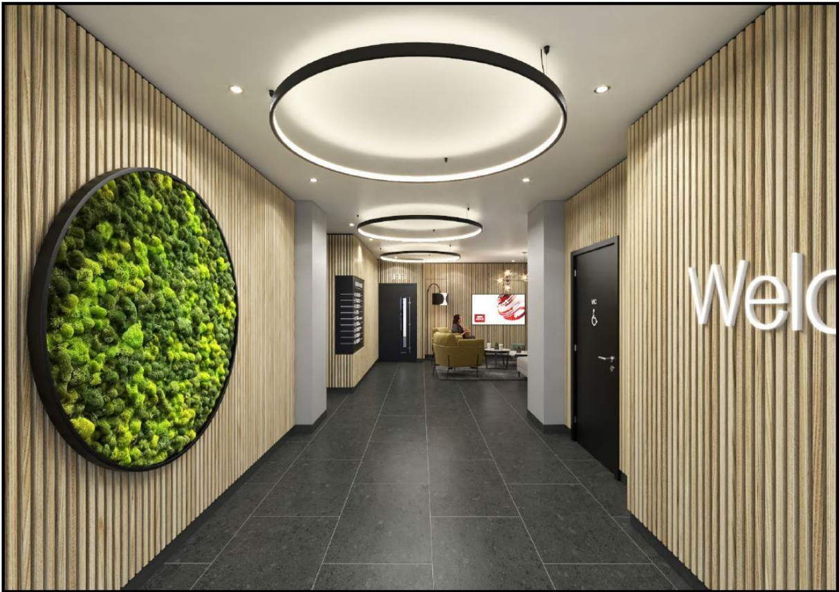
ELIZABETH HOUSE-CONCEPT GROUND FLOOR ENTRANCE - 1