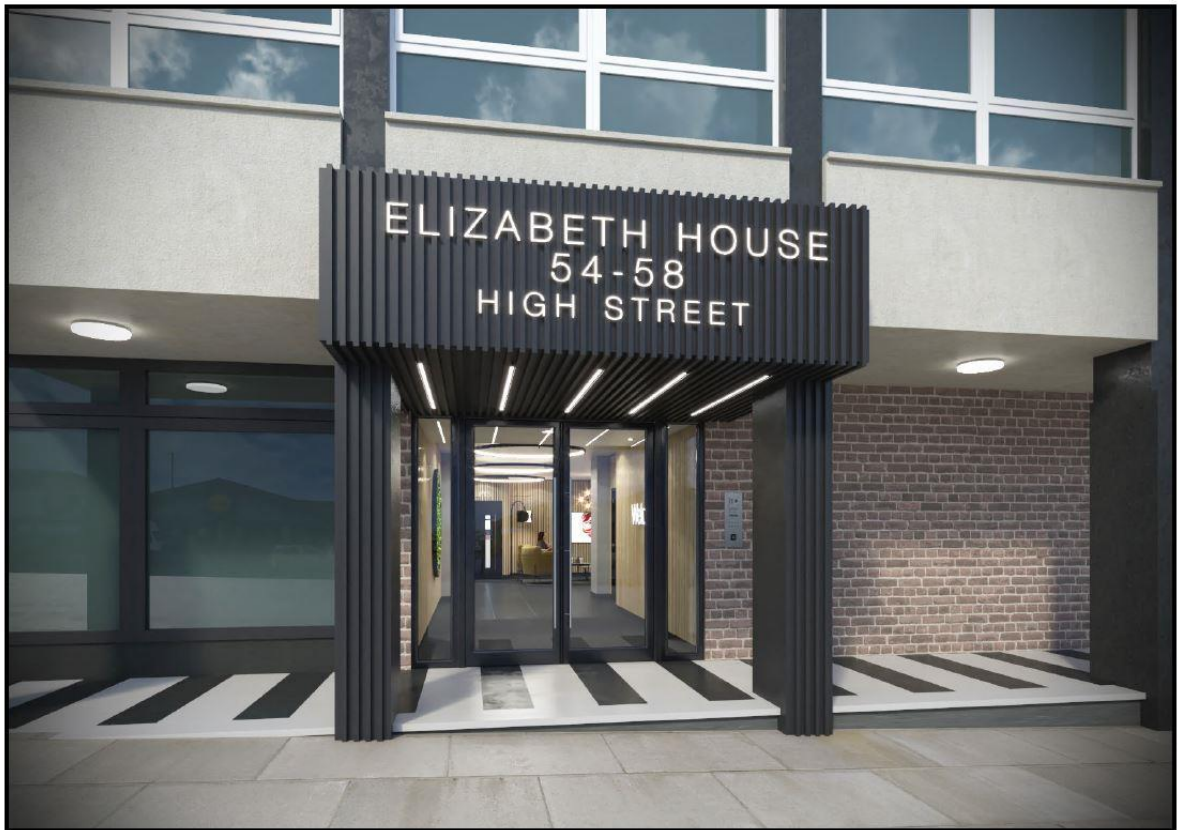
ELIZABETH HOUSE-CONCEPT EXTERIOR ENTRANCE-1