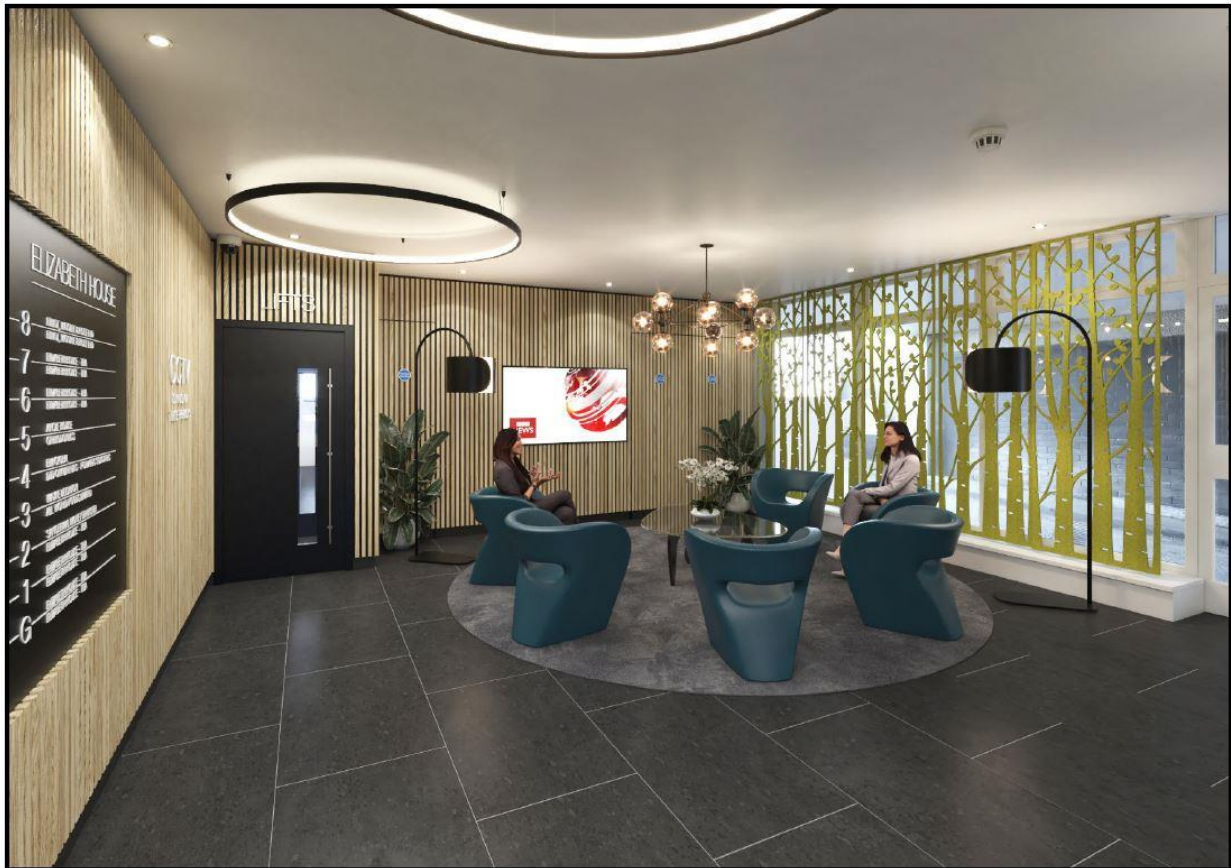
ELIZABETH HOUSE-CONCEPT, GROUND FLOOR ENTRANCE - 2 - OPTION 1

54-58 HIGH STREET, EDGWARE, MIDDLESEX HA8 7EJ