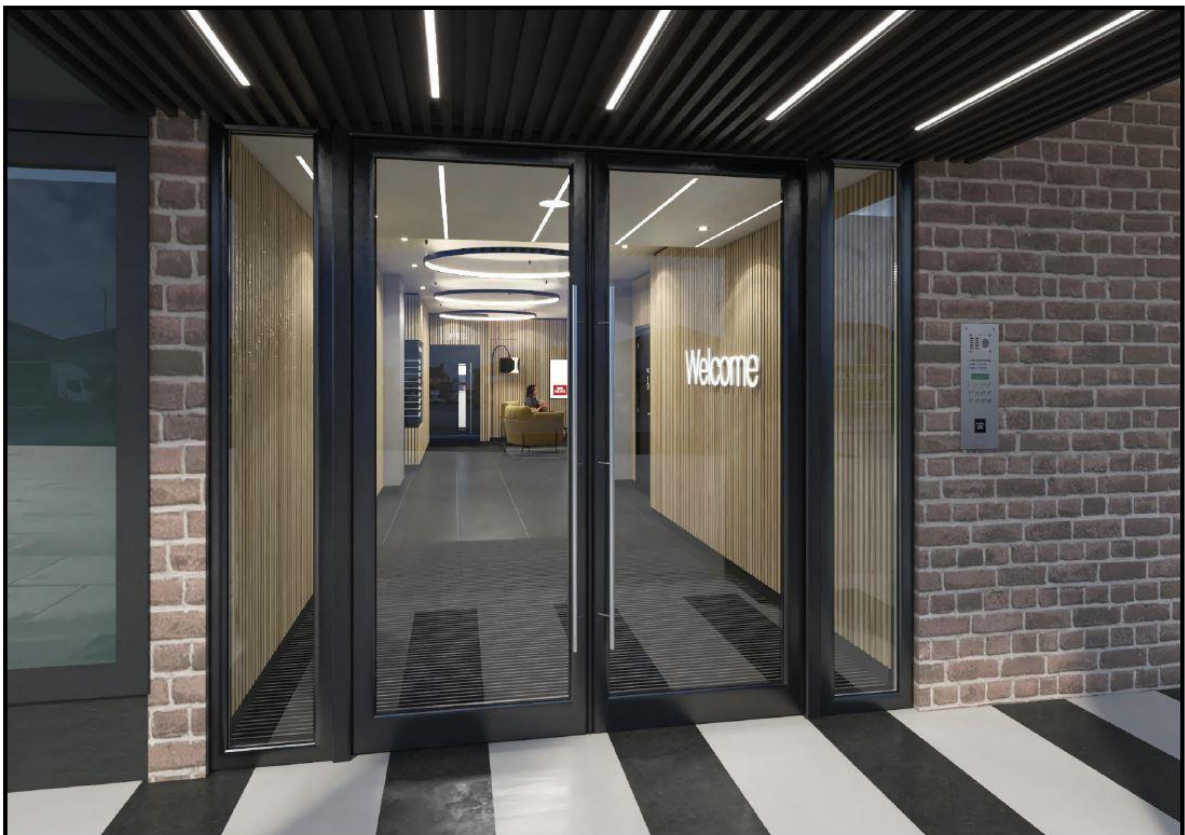
ELIZABETH HOUSE-CONCEPT EXTERIOR ENTRANCE-2