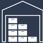
Storage & Distribution