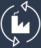
Industrial & logistics

The site is suitable for a variety of uses, including the following: