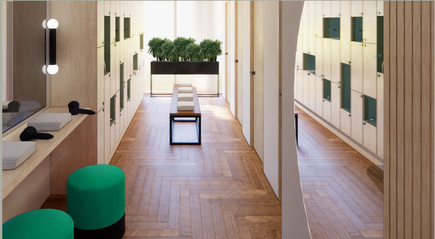
CGI of planned locker room

The building also benefits from outstanding public transport links with a tram stop on the doorstep, three train stations within walking distance and numerous bus routes close-by.