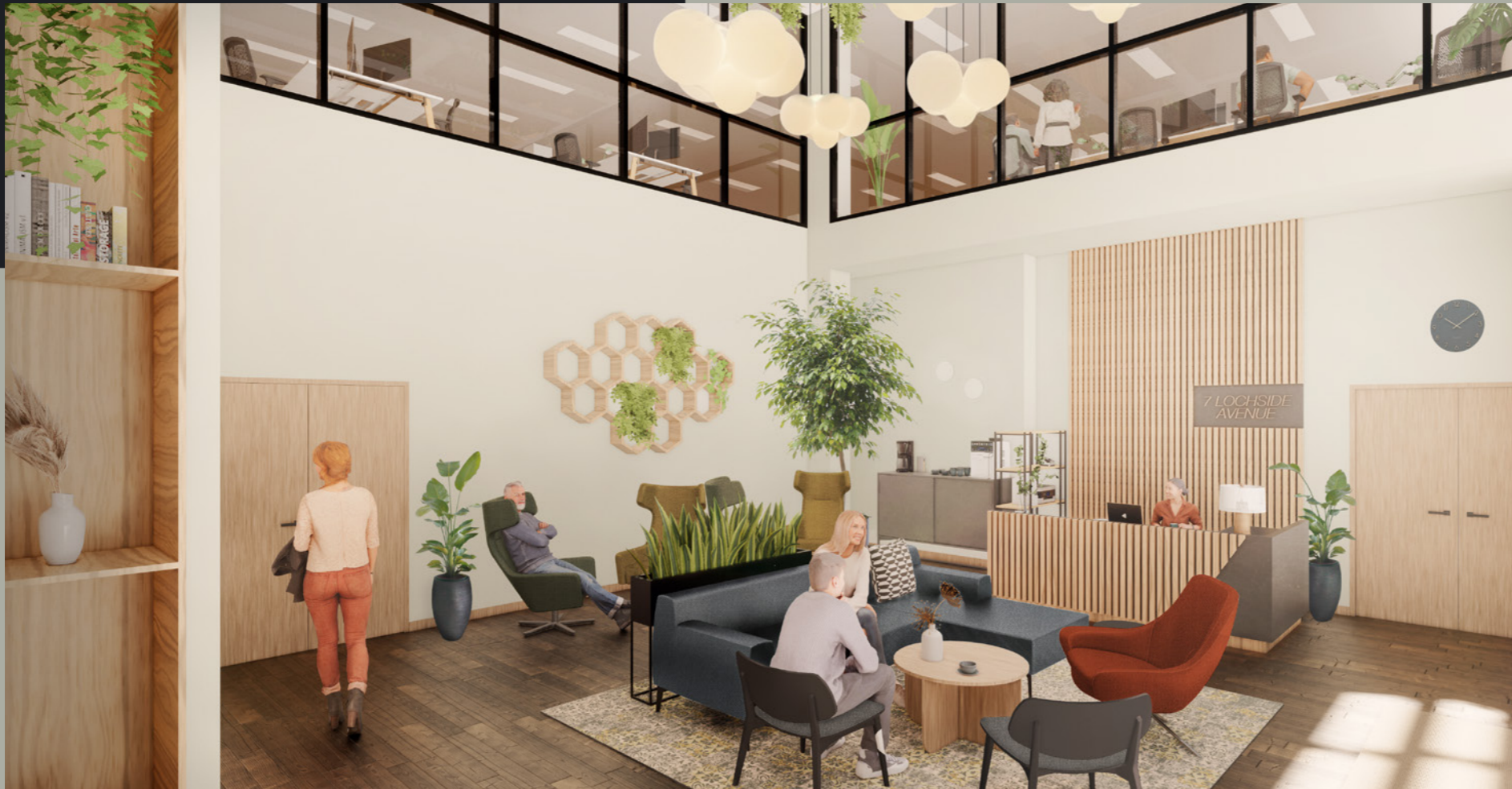
CGI of planned reception area

The atrium has been furnished to the highest quality, offering informal meeting or break out areas in an inviting, relaxing setting.