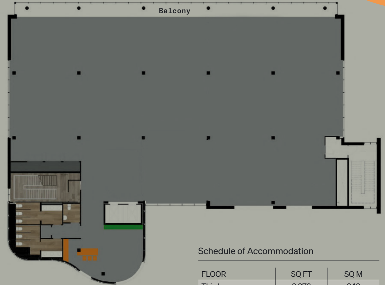
Schedule of Accommodation