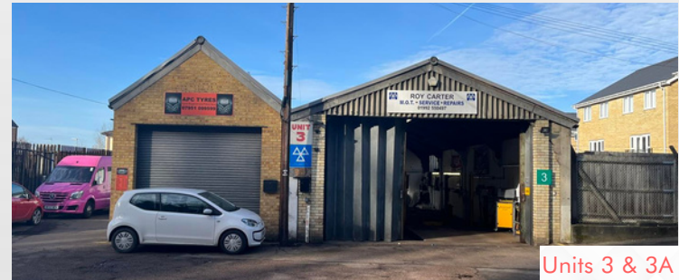
Units 3 & 3A

The property has a total site area of approximately 1.34 acres (0.542 hectares) which shows an attractive site cover of approximately 30%.