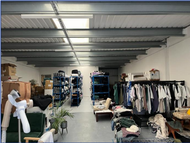
Unit 4 – First Floor