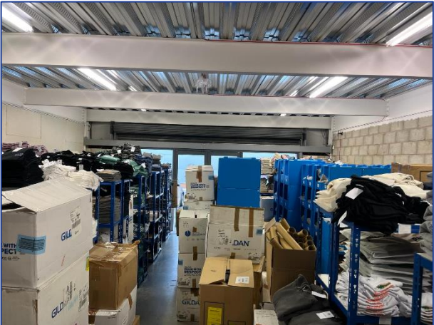
Unit 12 – Ground Floor