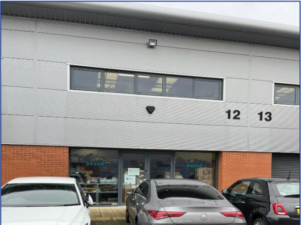
Unit 12 – Front Elevation