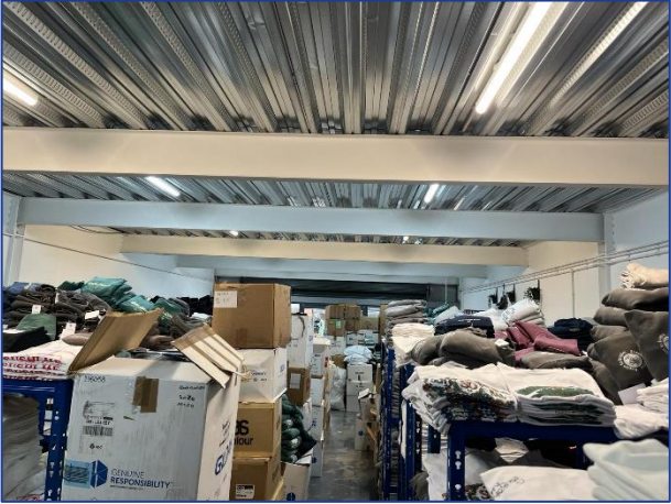
Unit 4 – Ground Floor