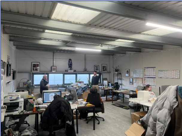
Unit 12 – First Floor