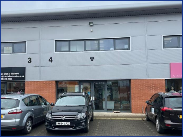
Unit 4 – Front Elevation