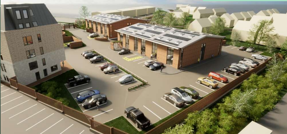
Visual of units 9 – 24 Thirkill Park Due for completion December 2023.