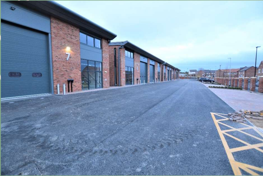
Frontage and secure parking area, fully lit with electric gates