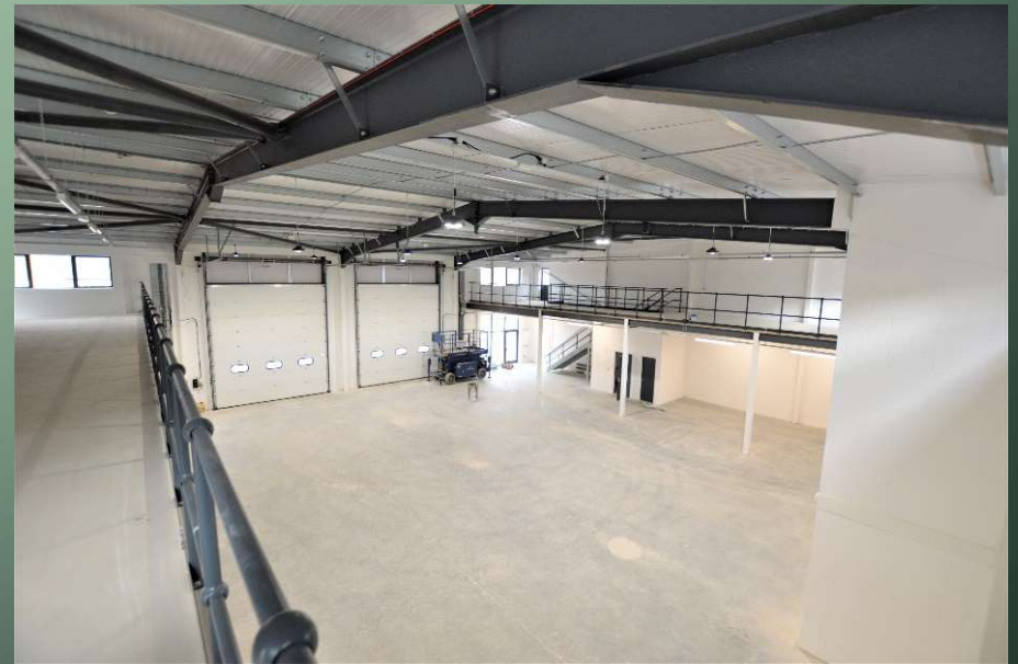
Under floor heating with air source heat pumps, intelligent LED lighting, mezzanine, shower and toilets