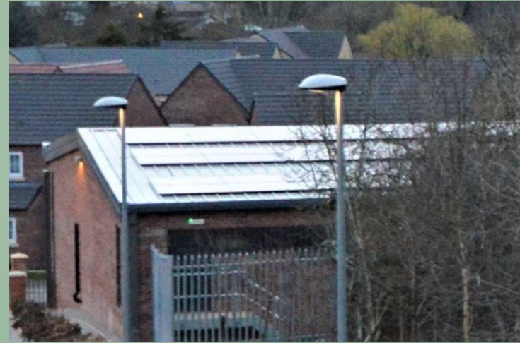
Solar panels generate electricity and powers heating