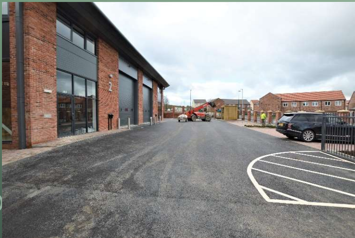
Anti-ram bollards and 2 electric chargers per unit