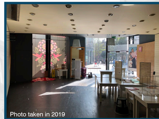
Photo taken in 2019