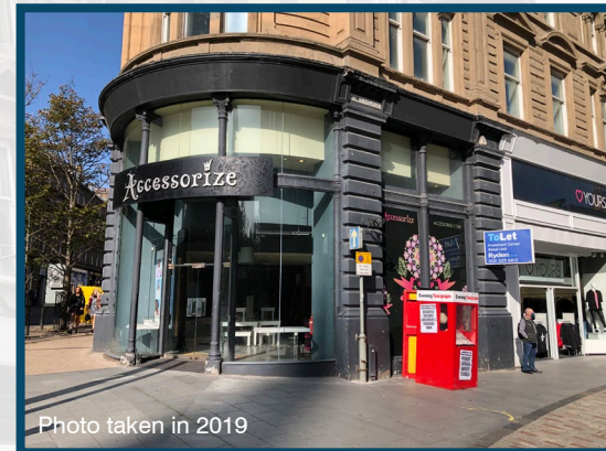
Photo taken in 2019