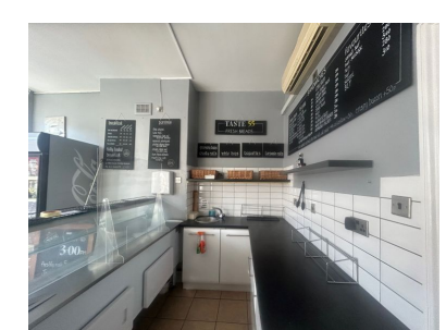
Rent: £16,500 Per annum Size: 455 Square feet Ref: #3192 Status: New on!