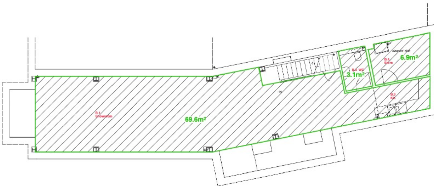
BASEMENT FLOOR AREAS