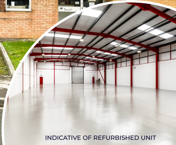
INDICATIVE OF REFURBISHED UNIT