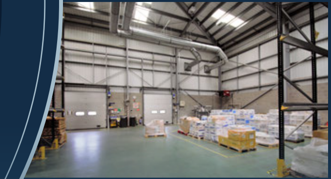
All Images For Indicative Purposes Only