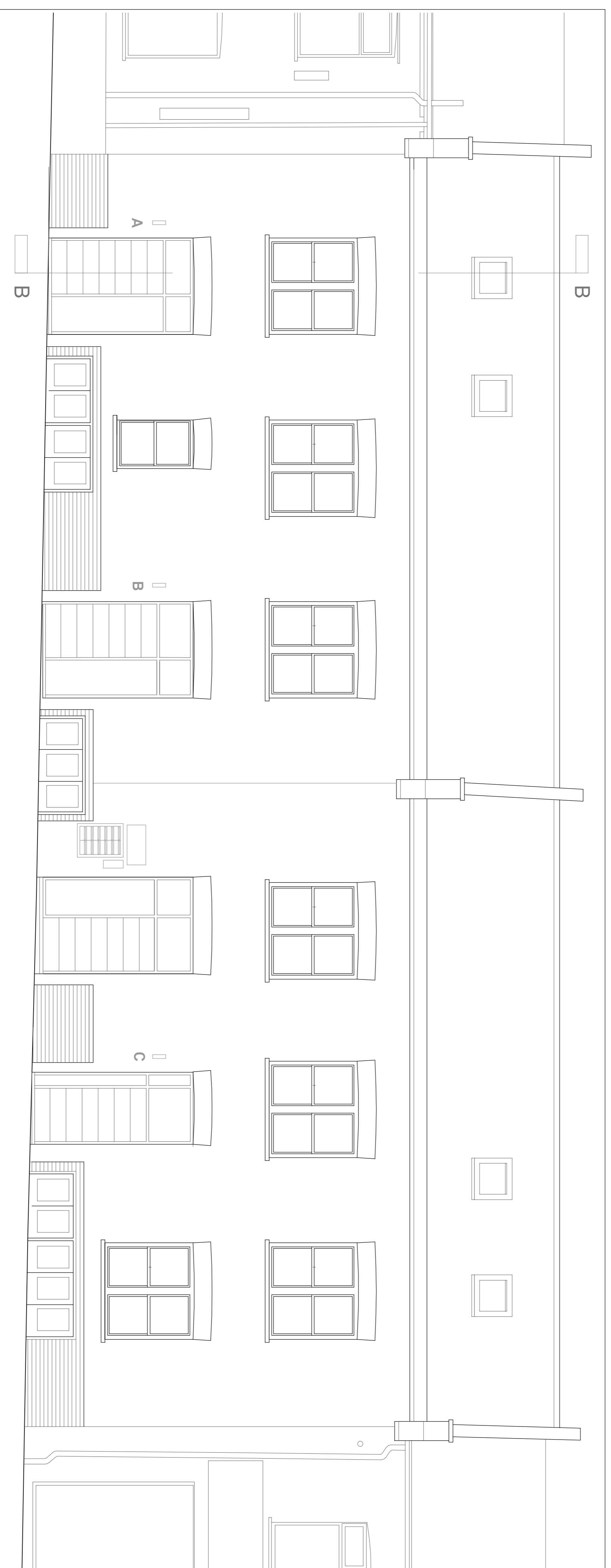
HARROW ROAD ELEVATION - AS EXISTING