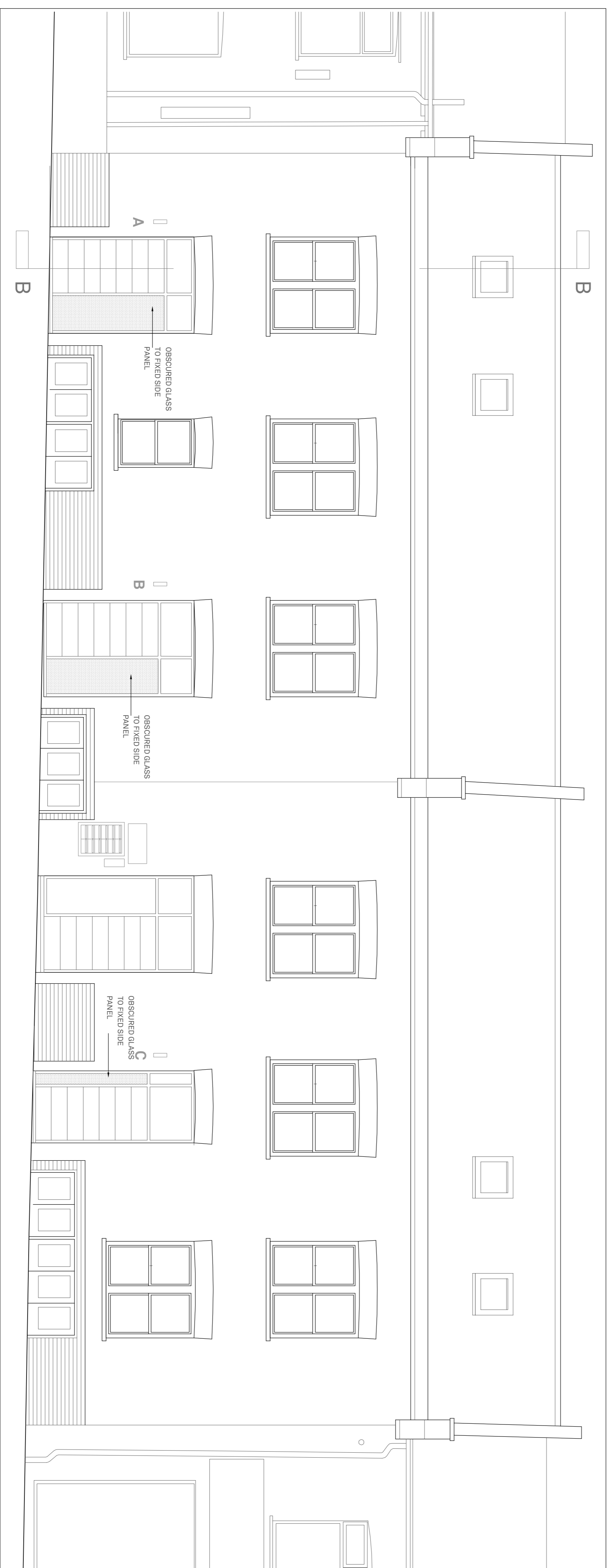
HARROW ROAD ELEVATION - AS PROPOSED