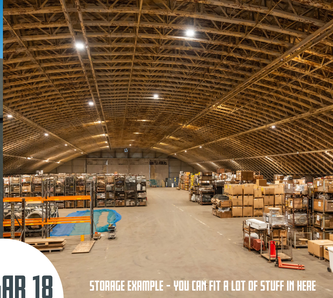
STORAGE EXAMPLE - YOU CAN FIT A LOT OF STUFF IN HERE