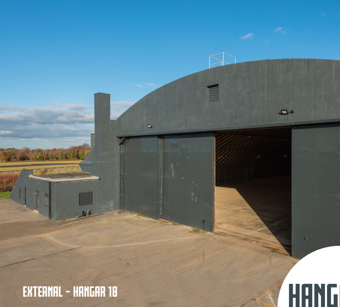
EXTERNAL - HANGAR 18