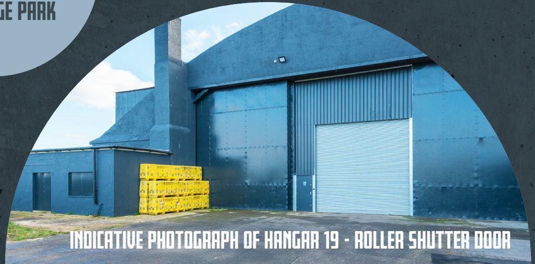
INDICATIVE PHOTOGRAPH OF HANGAR 19 - ROLLER SHUTTER DOOR