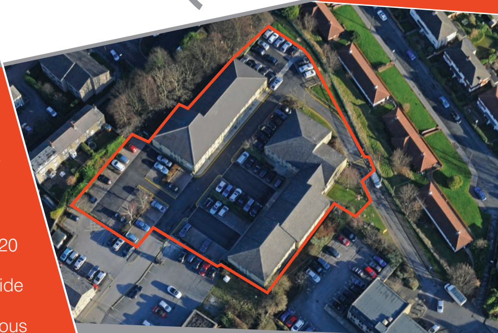
Feast Field ▪ Horsforth ▪ Leeds ▪ LS18 4TJ

Horsforth is a busy area of Leeds positioned approximately 5 miles north west of Leeds City Centre and offers excellent communication links with both Leeds and Bradford via the A6120 outer ring road. Leeds Bradford Airport is only 2 miles away. A wide range of retail shops, banks, a Morrisons supermarket and various pubs, cafés and restaurants are all within a few minutes walk of Feast Field.