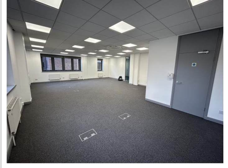
1<sup>st</sup> FLOOR SUITE – RECENTLY REFURBISHED