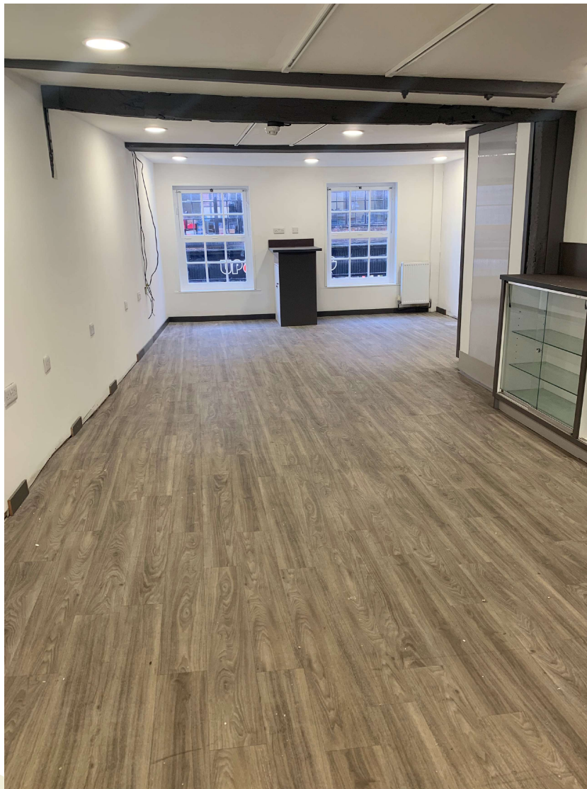
FIRST FLOOR RETAIL SPACE

Miles Lawrence mileslawrence@cartertowler.co.uk 07711 868 336