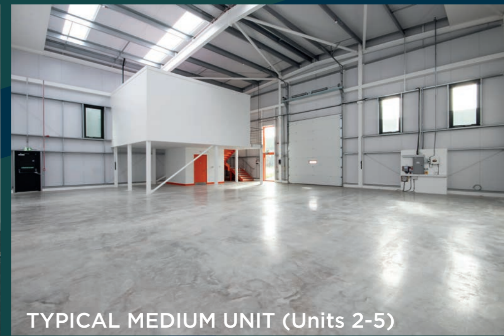
TYPICAL MEDIUM UNIT (Units 2-5)