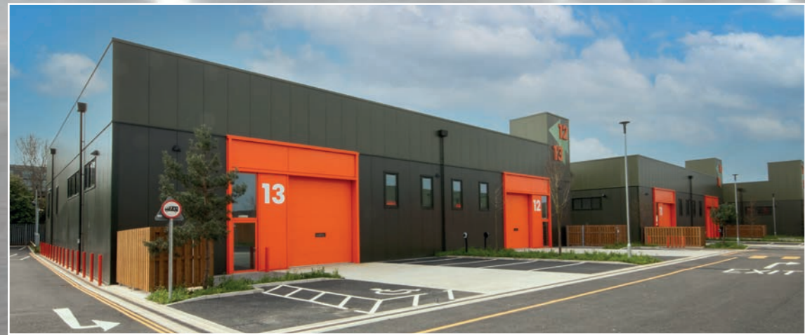
TYPICAL LARGE UNIT (Units 6-13)