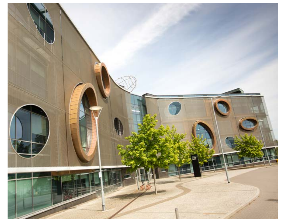
Northern Design Centre

Gateshead is fast becoming an important Tech-Hub with a regional and national importance, with 30% more technology employees than the national average, and forecast growth of 47% in the tech sector over the next 5 years, Baltic Place provides an excellent environment in which to locate your business.