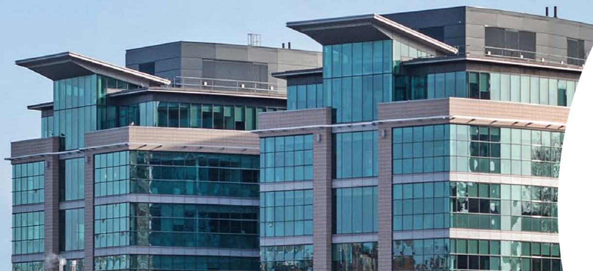
BALTIC PLACE EAST