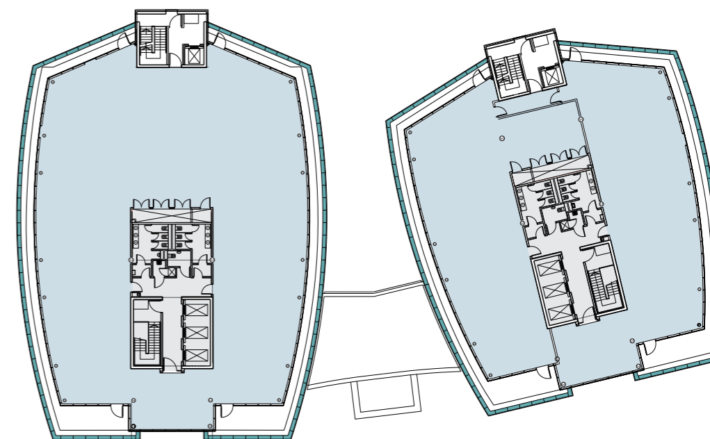
BALTIC PLACE WEST

The available office suites are as follows: