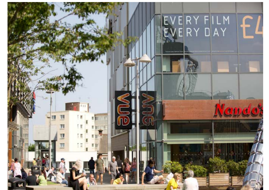
Gateshead Town Centre

Pedestrian access to Newcastle Quayside is enabled via the Millennium Bridge, broadening the amenity to occupiers at Baltic Place.