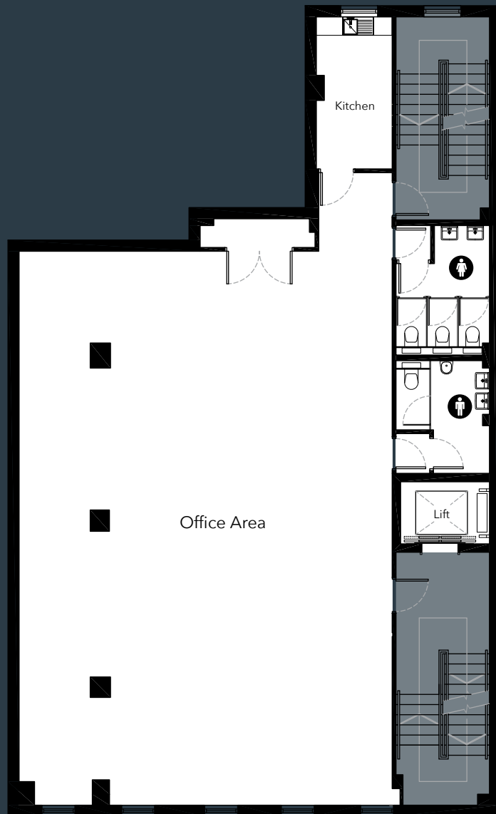
Typical Upper Floor