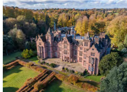
3 Rear of Hewell Grange