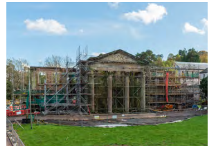
6 Ruins of the old Hewell Grange