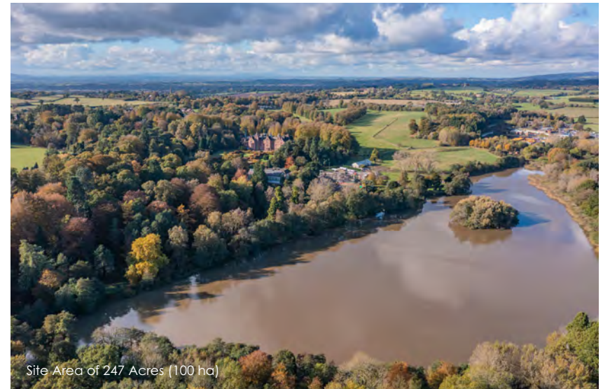
Site Area of 247 Acres (100 ha)