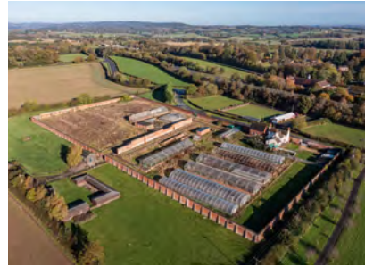
1 Walled Market Garden