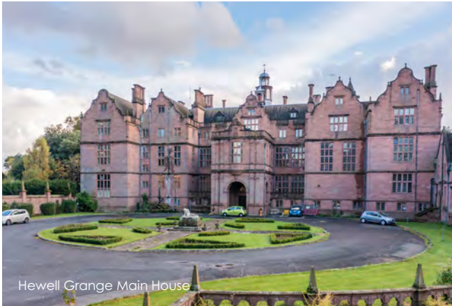
Hewell Grange Main House