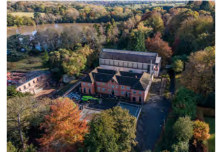
2 Former Real Tennis Court