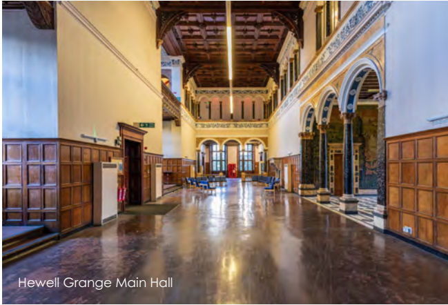
Hewell Grange Main Hall