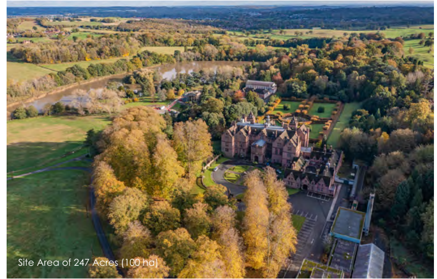
Site Area of 247 Acres (100 ha)