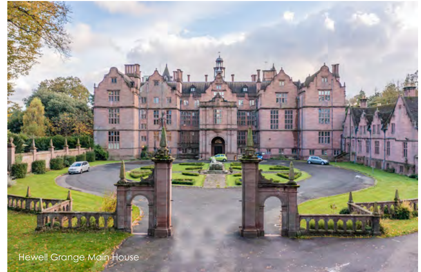
Hewell Grange Main House