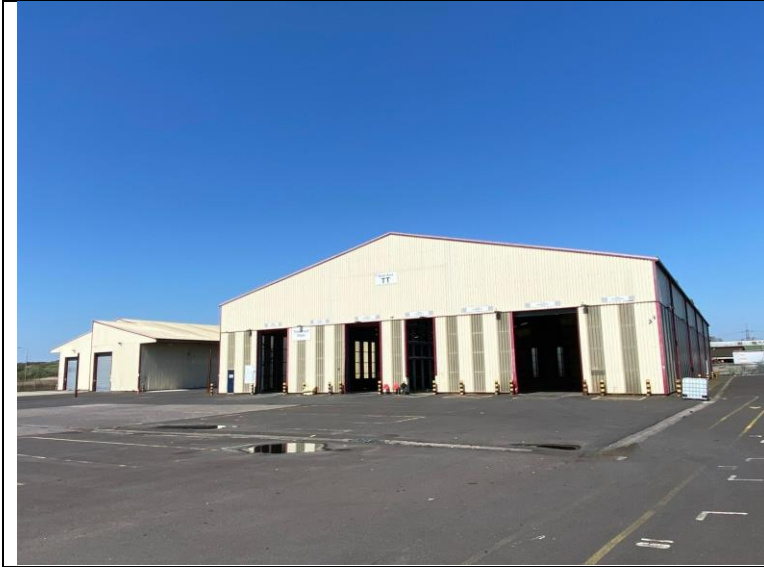
Atlantic Site, East Way Road

minimum eaves heights ranging 6.60m - 7.50m, on a fully fenced tarmac surfaced site of 5.91 acres, providing a low site density operation. The premises front onto West Way Road and benefit from office accommodation to the smaller of the two warehouses.