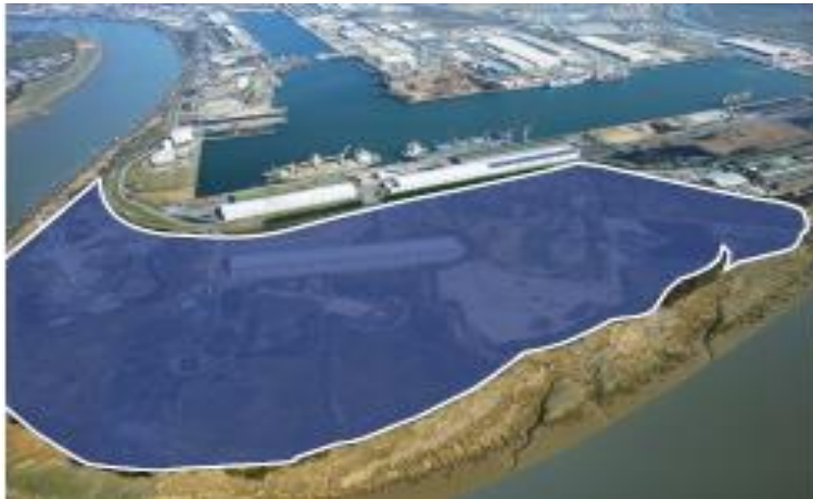
Land at West Way Road

minimum eaves heights ranging 6.60m - 7.50m, on a fully fenced tarmac surfaced site of 5.91 acres, providing a low site density operation. The premises front onto West Way Road and benefit from office accommodation to the smaller of the two warehouses.