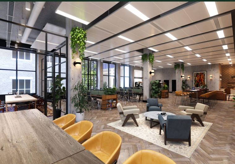
CGI: GROUND FLOOR FULLY FITTED

1,079 sq ft additional basement storage with 4 m+ floor-to-ceiling height.