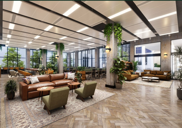
CGI: GROUND FLOOR FULLY FITTED