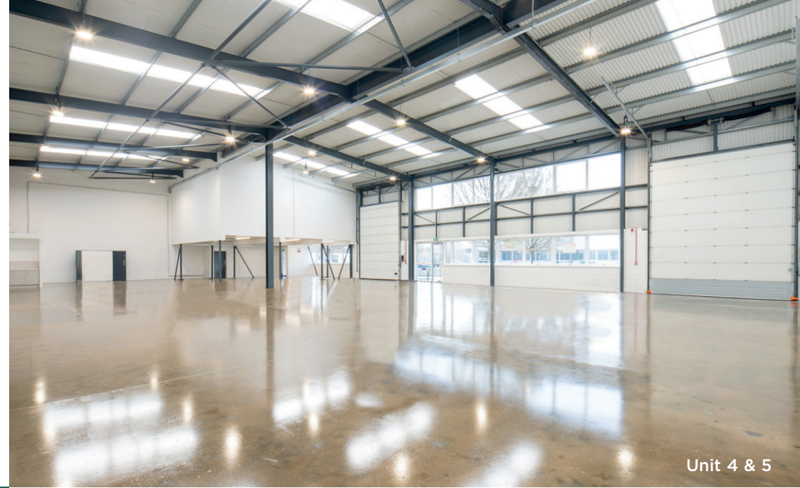
Unit 4 & 5