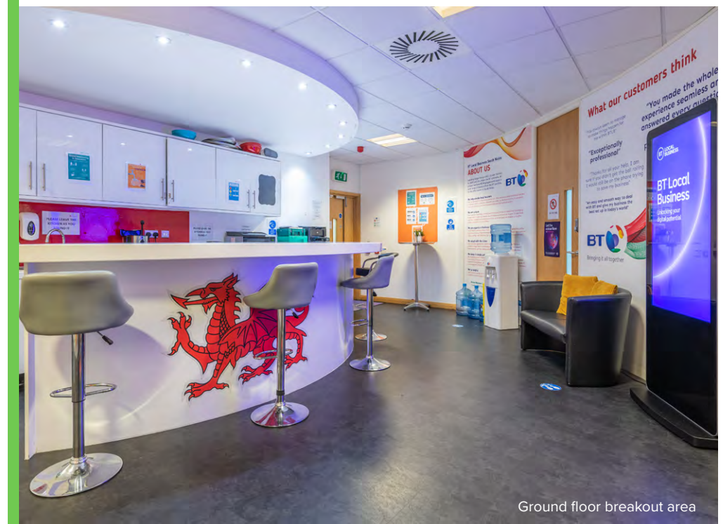
Ground floor breakout area

Raglan House is located close to Cardiff Gate Retail Park which provides a number of easily accessible amenities including ASDA, Costa Coffee, McDonalds, B&Q and PureGym.