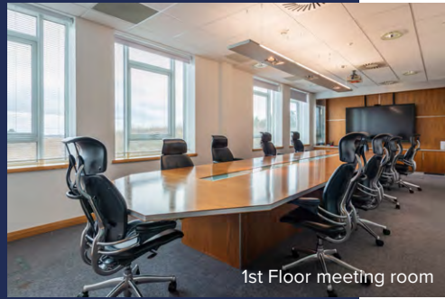
1st Floor meeting room