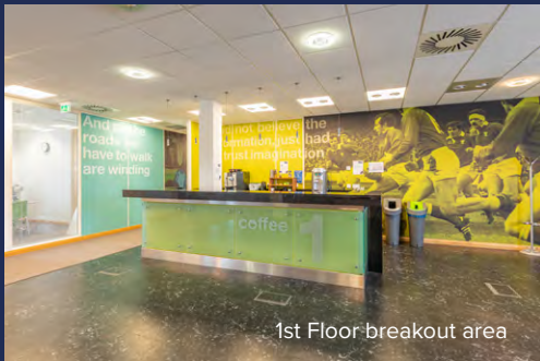
1st Floor breakout area