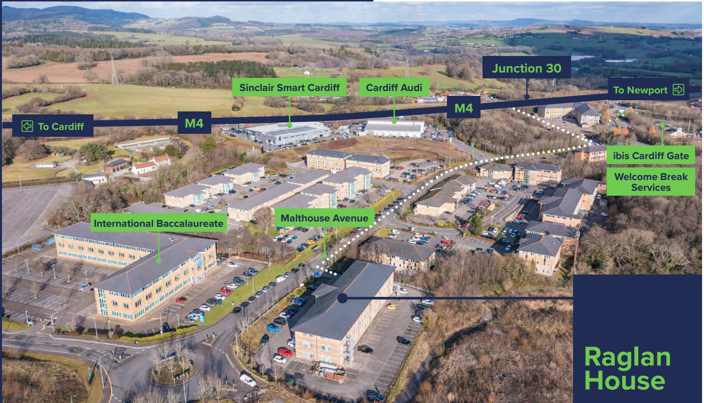
Cardiff Gate Business Park occupiers include: SSE, Hoare Lea, Regus, CCS McLays, Insight Law, Royal College of Nursing