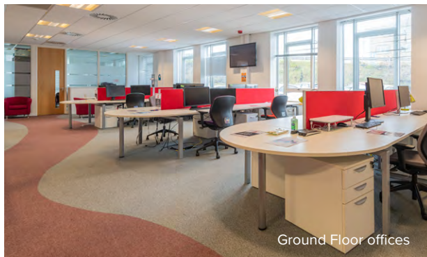
Ground Floor offices

Alternatively vacant possession can be achieved in line with lease expiry in October 2022.