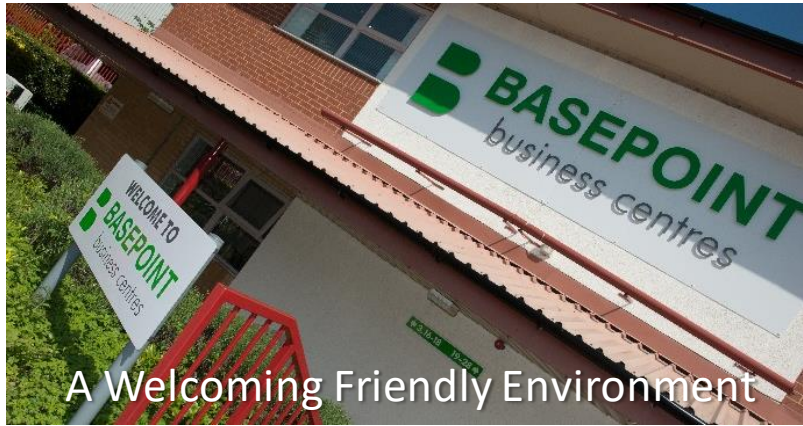
A Welcoming Friendly Environment