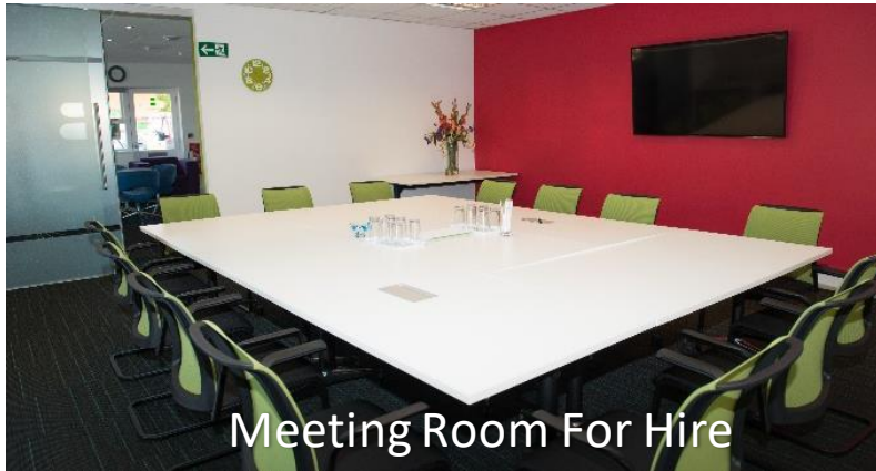
Meeting Room For Hire