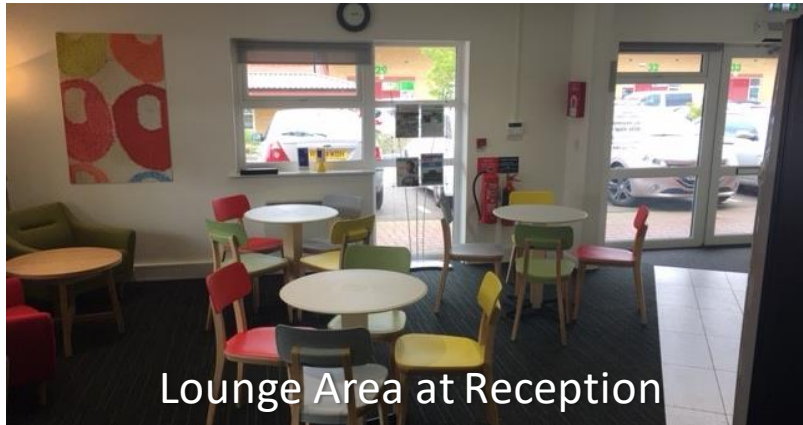
Lounge Area at Reception