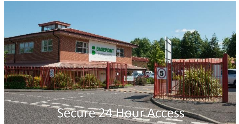
Secure 24-Hour Access