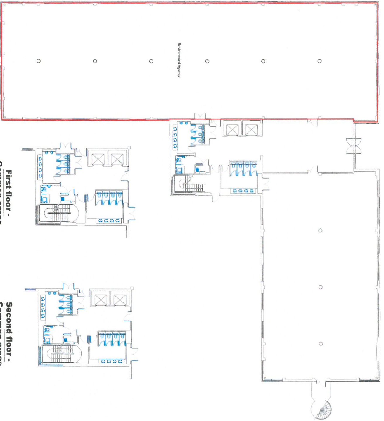
First floor - Common areas