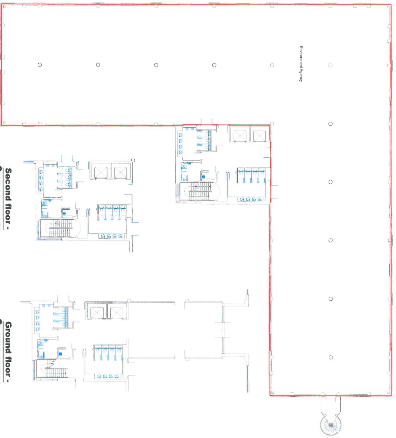
Second floor - Common areas