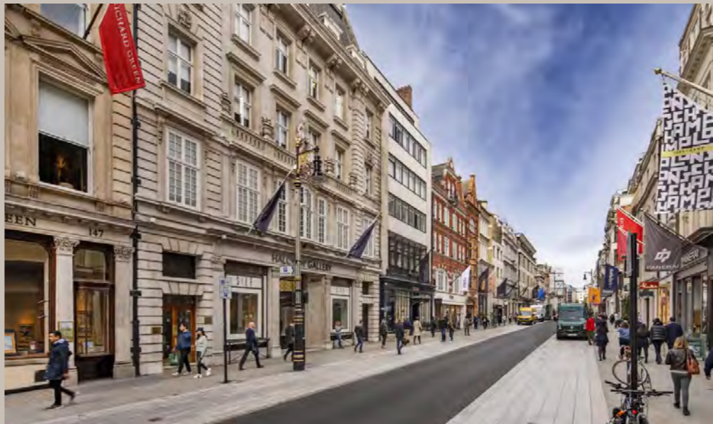
NEW BOND STREET