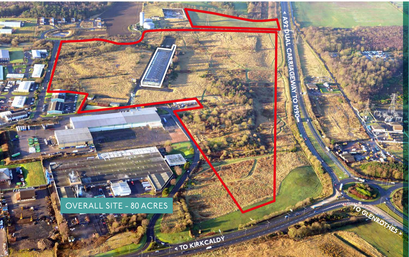
OVERALL SITE - 80 ACRES