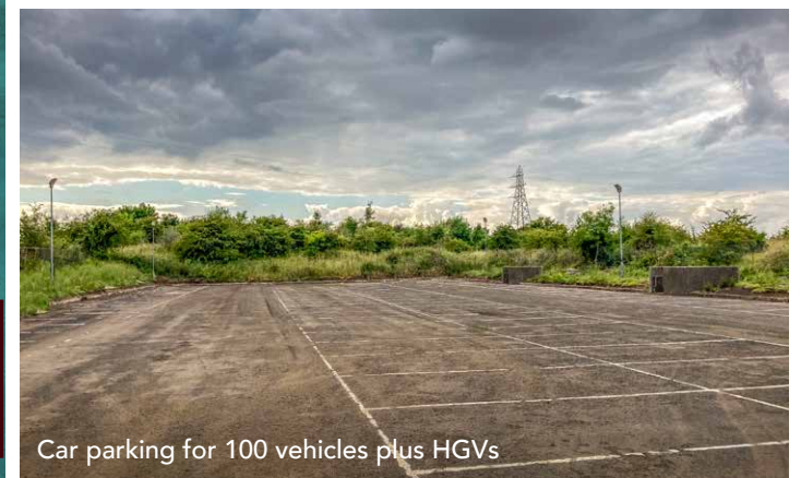
Car parking for 100 vehicles plus HGVs