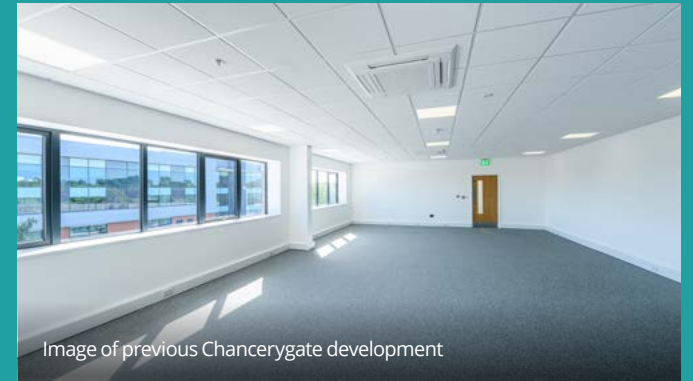
Image of previous Chancerygate development