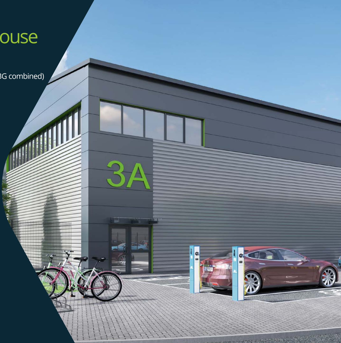
Computer Generated Image of units 3A-3G