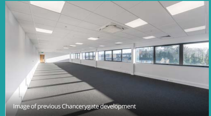
Image of previous Chancerygate development