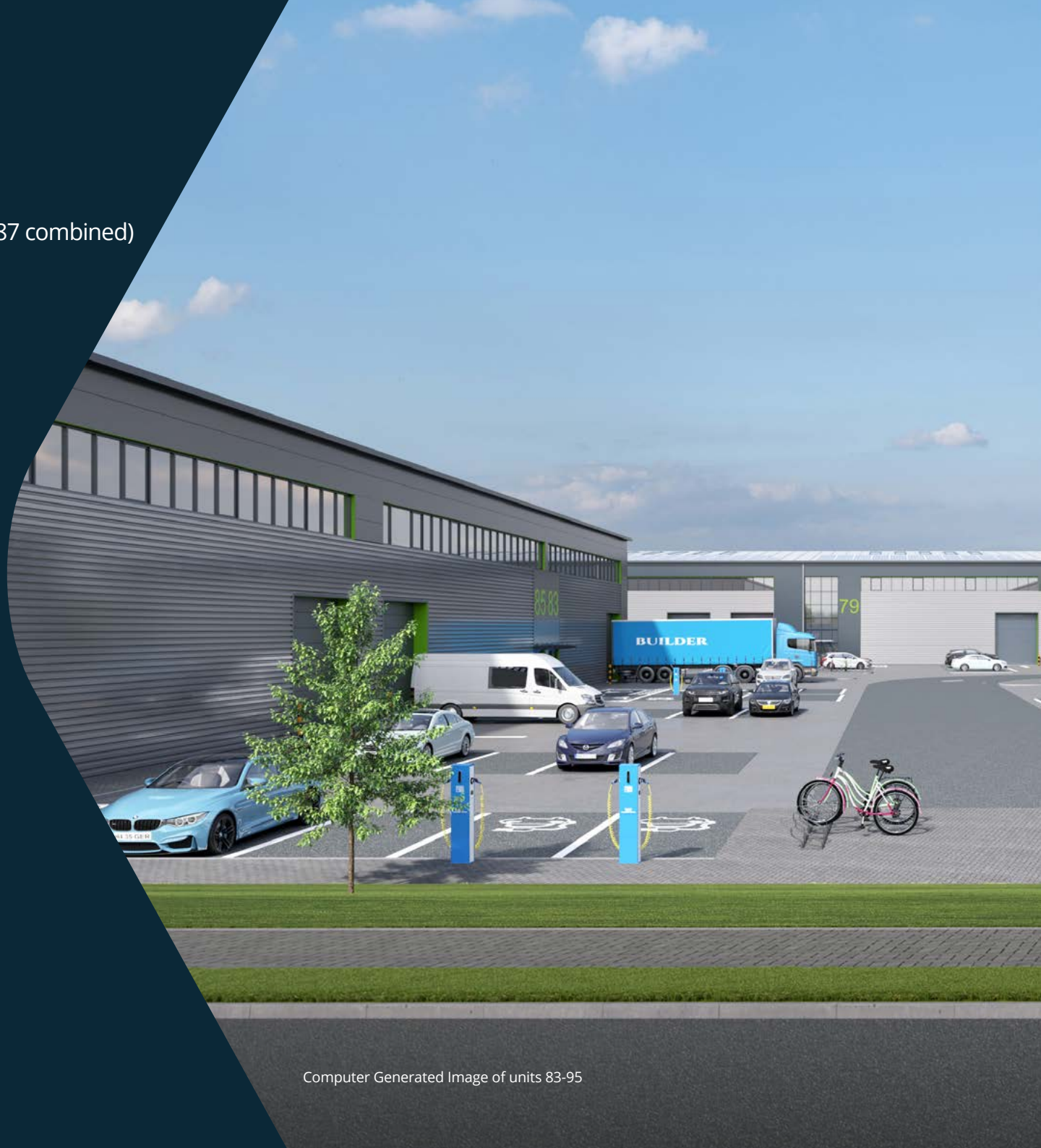
Computer Generated Image of units 83-95