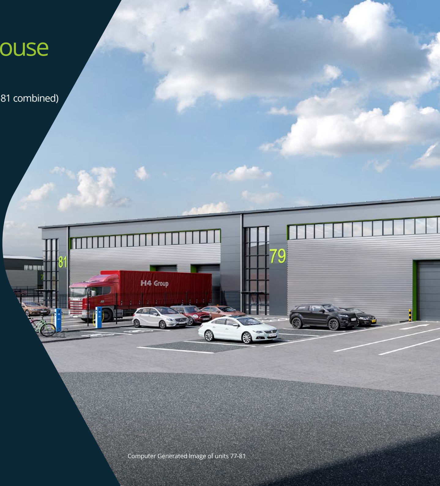
Computer Generated Image of units 77-81