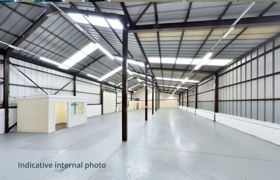
Indicative internal photo