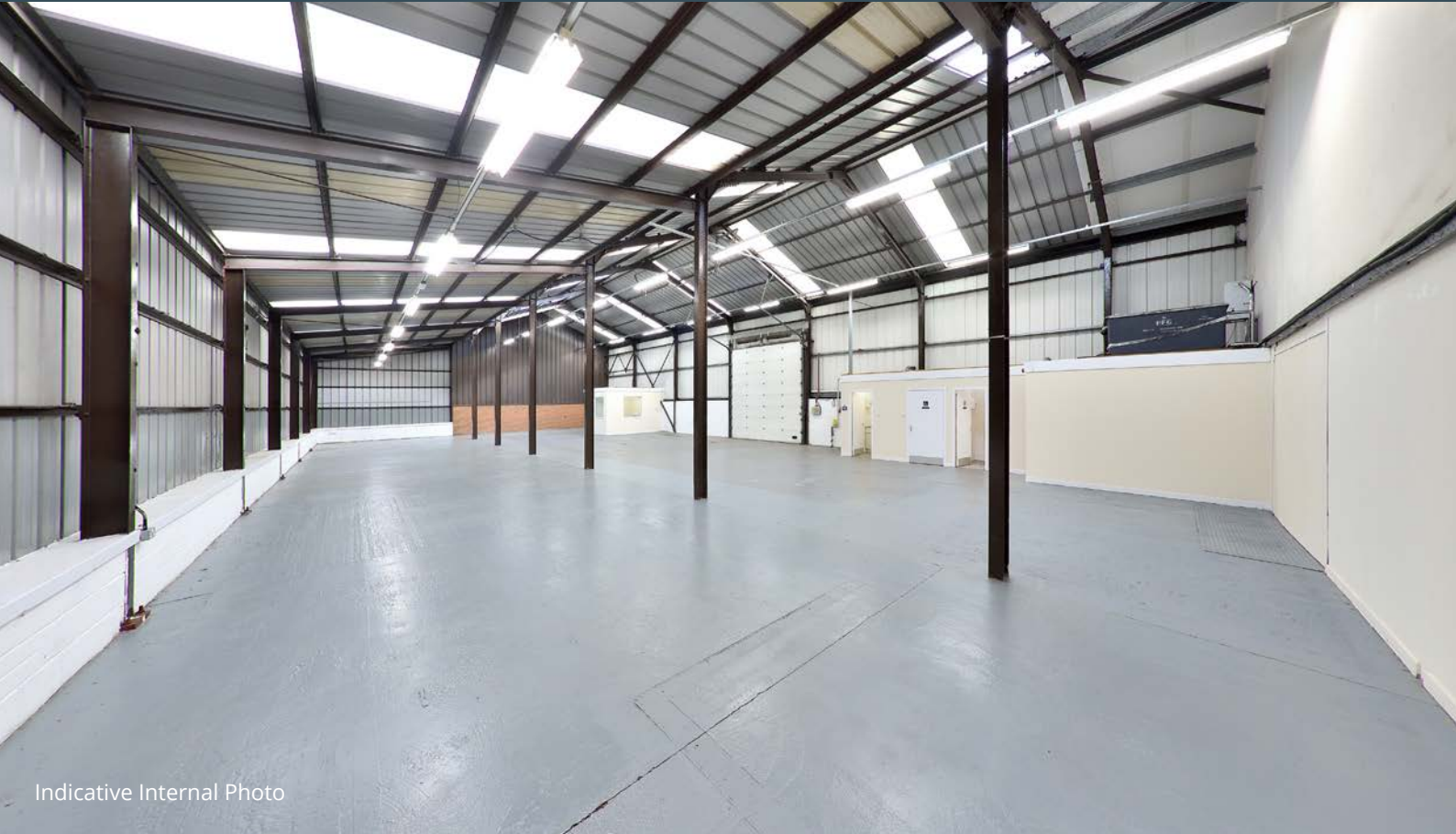
Indicative Internal Photo