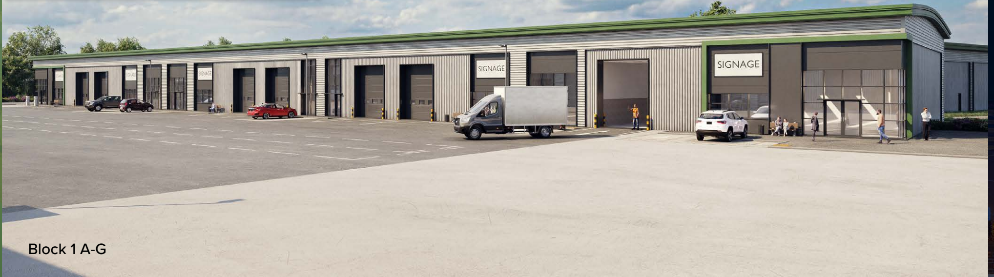
Block 1 A-G

The premises will benefit from 100% rates relief for the first twelve months of occupation.