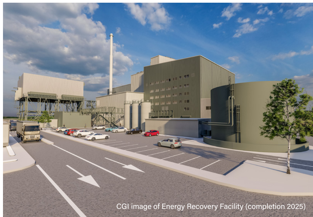
CGI image of Energy Recovery Facility (completion 2025)