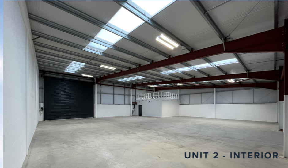
UNIT 2 - INTERIOR