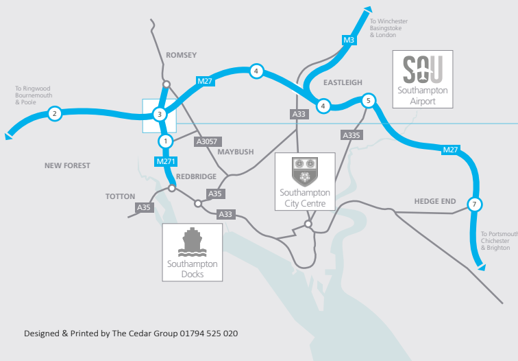
Phase II construction completed

James Allen 023 8083 5962 07976 677482 ja@keygrove.com