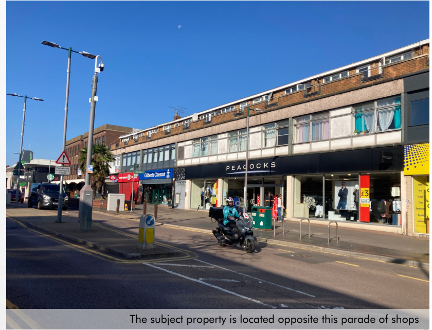
The subject property is located opposite this parade of shops

Each party to be responsible for their own legal and consultancy costs.